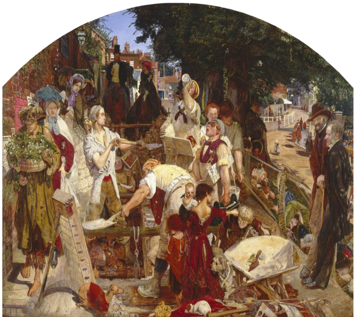
"Ford Madox Brown, Work, 1852–65, oil on canvas, 137 x 197.3 cm. Manchester City Art Galleries, Digital image courtesy of Manchester City Art Galleries"