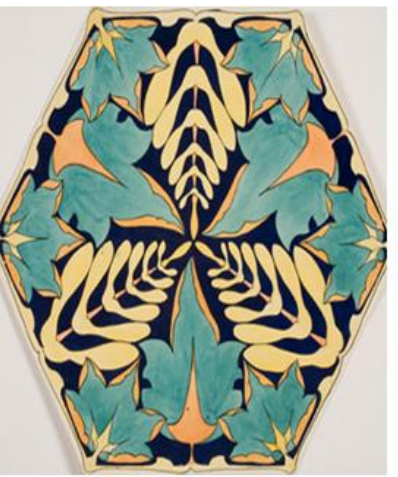
Floral Design , Doris Tutill, c.1930. Watercolour on paper. UC/MBL/Uncat7