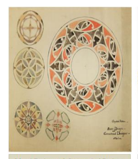
Maori Design and Geometrical Designs, Chrystabel Aitken, 1924. Oil on Canvas. UC/MBL/1675

often dismissed and described as 'decorative' or 'applied' art. Hence the composite term, Arts and Crafts, was born (Ann, 2002).